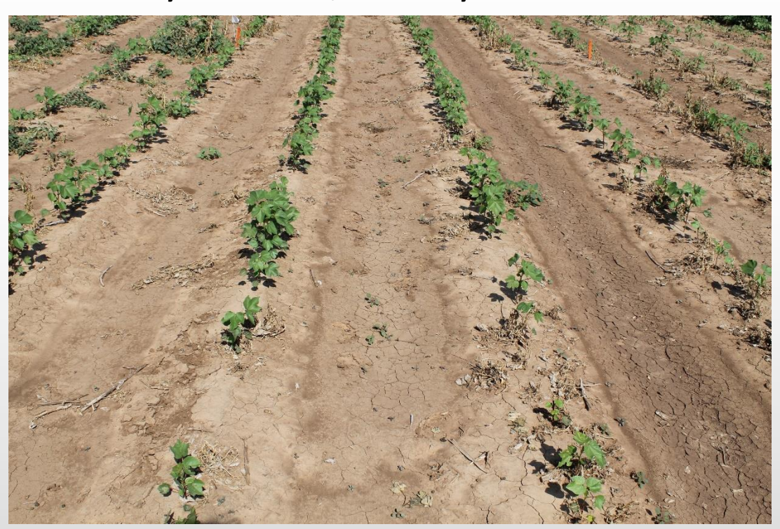
What's hard to capture in this picture: numerous 0.5-inch to 1-inch Palmer