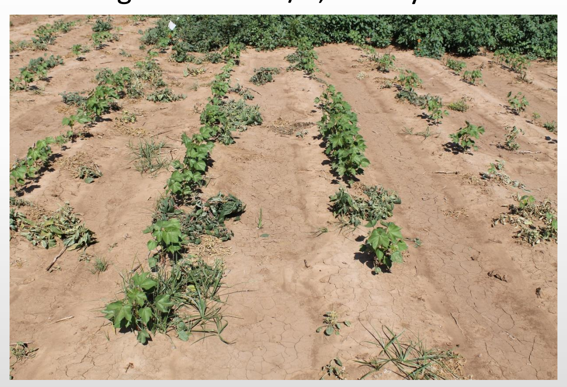
Engenia 12.8 oz/A, 10-day interval