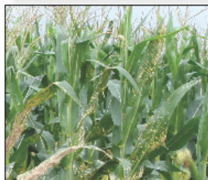
Very low concentrations of some herbicides drifted on to non-tolerant crops can cause noticeable injury.