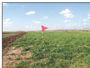
Flags should be placed at all likely entry points into the field.